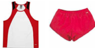
singlet/shorts in red

So instead, we are going with the "Houston Frontrunners" by itself. Here is the singlet and shorts we would like to buy from eastbay.com